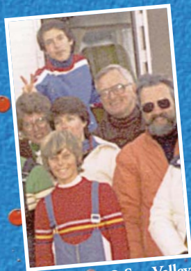
San Diego @ Sun Valley 1980