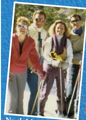
North Island @ Tahoe 1988