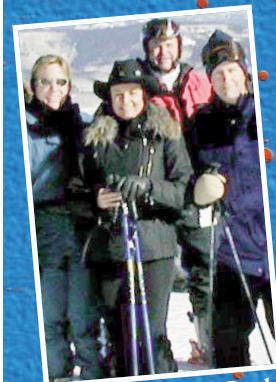
Action @ Beaver Creek 2003