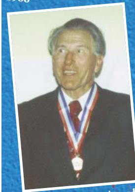
Alpine League Awards