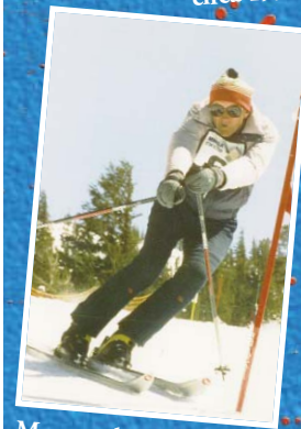
Mammoth Standard Race 1986