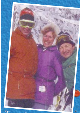
Torrey Pines @ Vail 1975