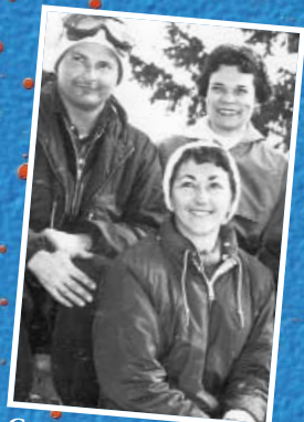
Convair @ Sun Valley, ID circa 1950s