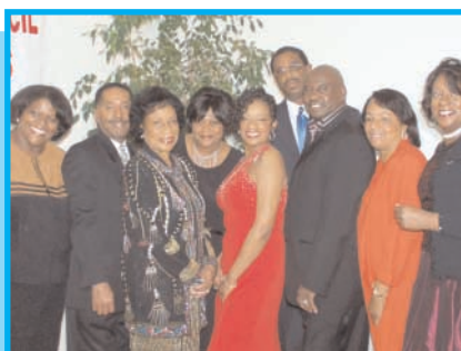
Four Seasons West Ski Club