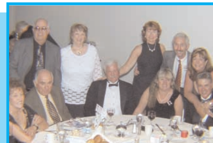
Auslich, Tri Valley, and Pacific Rim