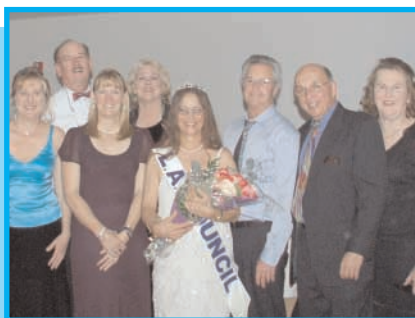
Single Ski Club of Los Angeles