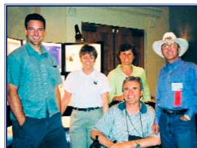
Far West 2003 Convention in Rancho Mirage— Olympic Medalists Chris Klug, Nancy Greene, Jimmie Heuga, Debbie Armstrong, Billy Kidd.