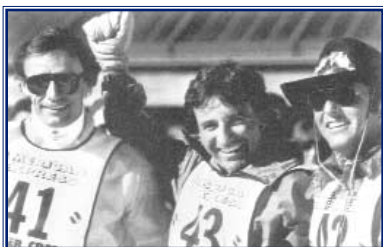
Jean-Claude Killy, Jimmie Heuga & Billy Kidd — Challenged FWSA clubs in 1989 to a North versus South competition in the Jimmie Heuga Snow Express at Mammoth Mountain.