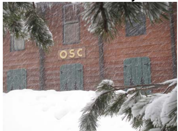
The lodge in snow over the MLK weekend.

The committee to nominate new Board Members will be forming this month. Please consider serving on this committee or even better, the OSC Board. The job descriptions are posted in the Downski for each position, and it is a chance for you to make a difference. Please feel free to contact