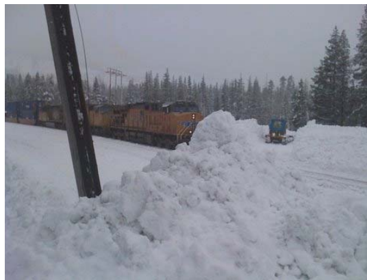
The train had to wait for the plow too.