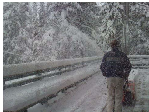
Todd clearing the deck. Again.