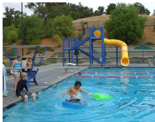
Sometimes they didn't.