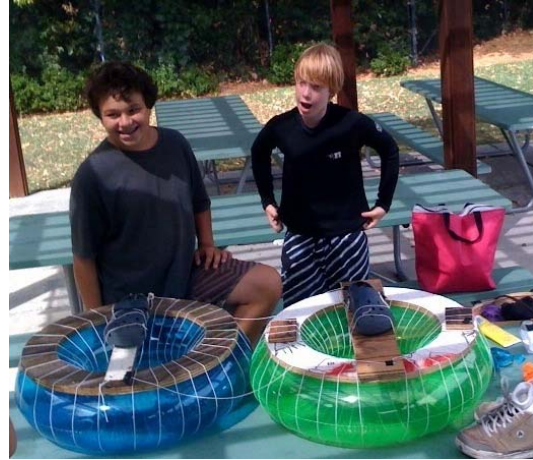
Engineers: The boys built the floating shoes from swim rings, crocs, boards and twine