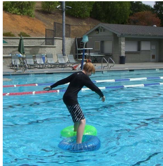
Sometimes they worked.