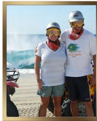
▲ ATVing ▼ Balcony Vista