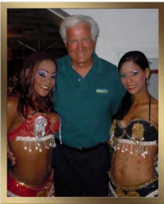
▲ Entertainment ▼ Our Ship